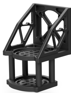
Extension 80mm/ 160mm