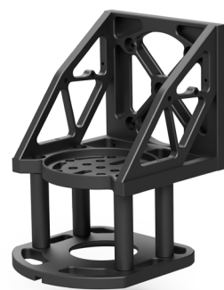
Mitchell female mount